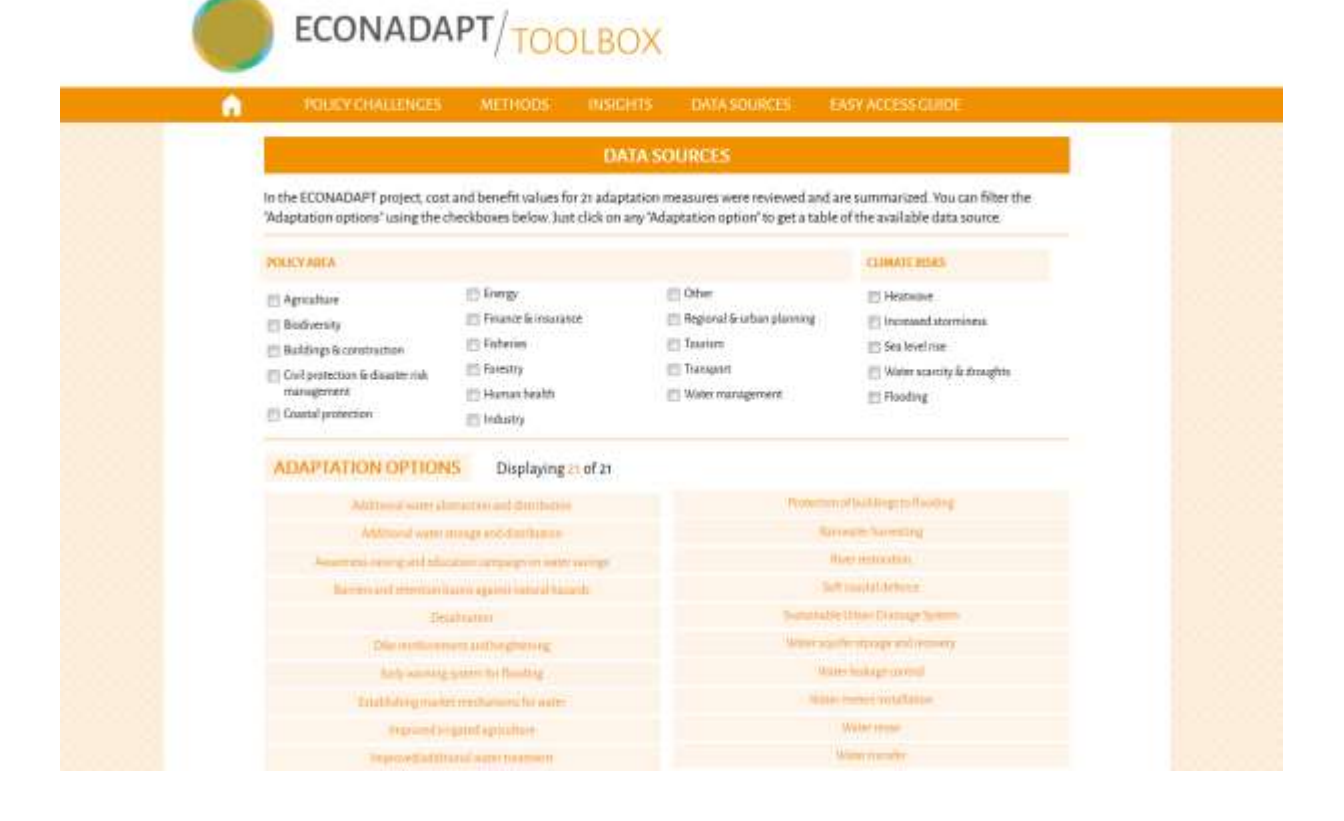
Figure 1: Screenshot of data repository: search criteria and list of options

Users can directly choose adaptation measures via a list of the included options.